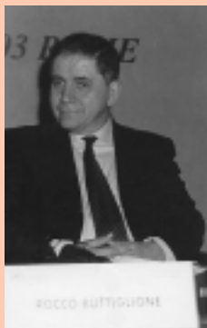
On. Rocco Buttiglione, Minister for EU Policies